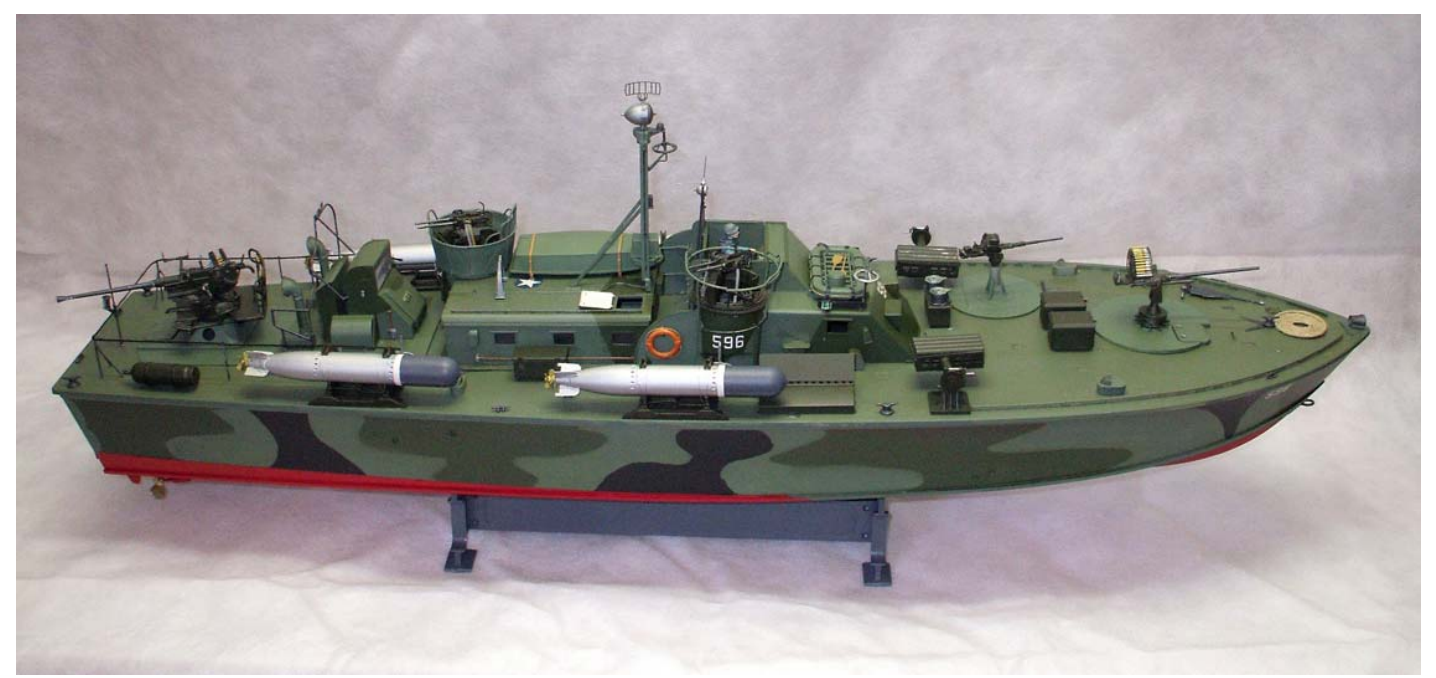
This is the finished model.

This is a great build and I did it in about 70 hours. What would I change? Pity that the deck was not made to look as if it was wooden planked. It looks ridiculous the way they have the anchor with a bit of rope to the bow ring. 80 ft long, weighing 60 ton, with a little Danforth and no winch? As I live on the coast of the Pacific Ocean I know how mean it can be. Some figures would also be great considering the price. I am making my own from some left over from the Italeri Landing Craft.