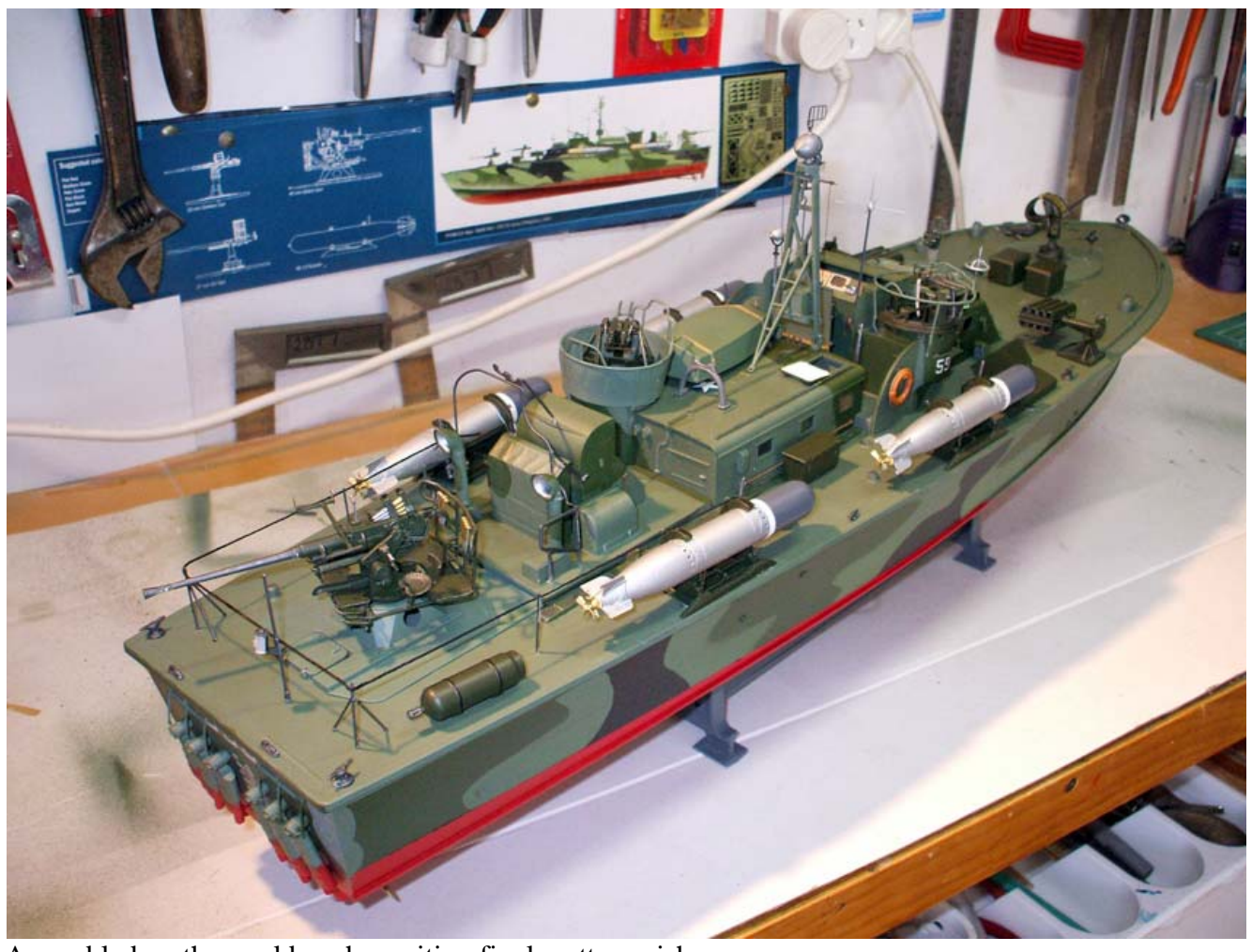
Assembled on the workbench awaiting final matt varnish.