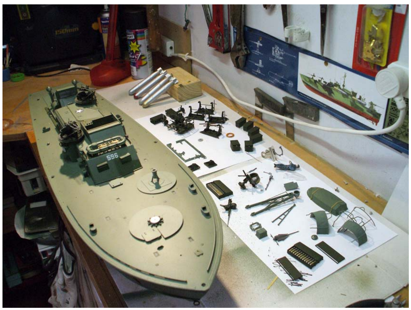
Finally ready for assembly.