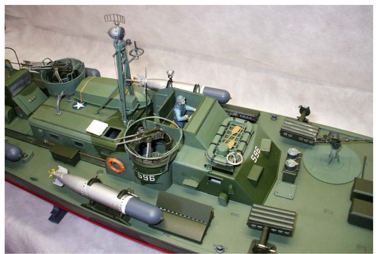
Crew member altered from another kit.