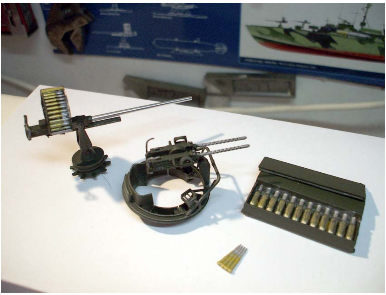
Picking out the ammunition in gold and silver makes it realistic.